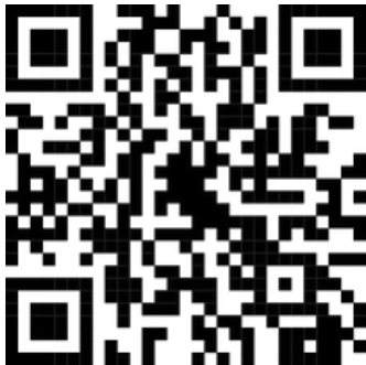
Scan code for mobile Menu